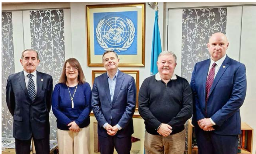
the Minister for Public Expenditure, NDP Delivery and Reform, Paschal Donohoe T.D., visited Brú na bhFiann recently.

Office of Veteran Affairs: ARCO, IUNVA and ONE have jointly promoted the establishment of an Office of Veteran Affairs. ONE, together with the Irish United Nations Veterans Association, made a written and oral submission to the Oireachtas Joint Committee on Foreign Affairs and Defence on 16 November 2021. The Cathaoirleach of the Committee Mr Charles Flanagan T.D. wrote to both An Taoiseach and the Minister for Defence on 17 December 2021 recommending the development of a “National Veterans’ Policy and an Office of Veterans’ Affairs.”