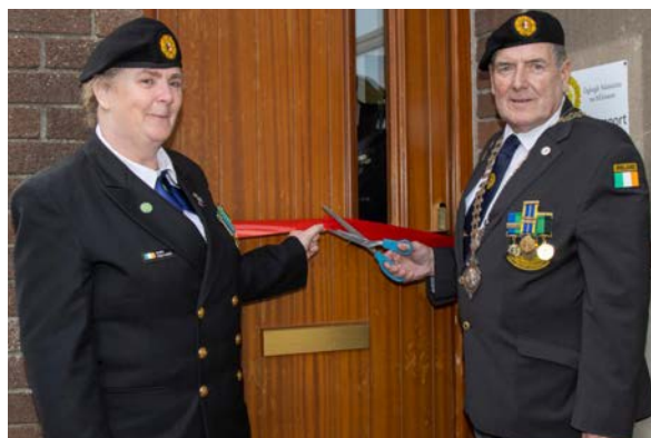
Opening of ONE's newest Veteran Support Centre in Carrick-on-Suir

All Ireland Mental Health Support System: ONE, supported by the Leopardstown Park Hospital Trust, launched our pilot 24/7 Mental Health Support Helpline in Brú na bhFiann, as part of Fuchsia Appeal 2023 launch on 21 September 2023. This initial 24/7/365 Mental Health Support Helpline will support veterans of the Defence Forces both North and South. Referrals from this service are initially to ONE Veteran Support Officers (Counsellors). Spectrum Life together with Laya Healthcare are contracted to pilot this programme. The medium-term ambition, as outlined in Goal 6 of ONE's Strategic Plan, is to put in place an All-Ireland Veterans' Mental Health Support Helpline that would seek to address the mental health issues faced by all veterans on the Island of Ireland, both North and South. The vision is that this would be funded by the respective governments or by a North South body such as Shared Island or Peace Plus.