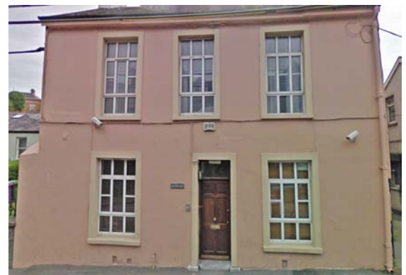
Brú Uí Choileáin / Cork City Home

ONE’s fifth home in Cork City (Brú Uí Choileáin) with 6 bedrooms is being developed in partnership with Cork City Council with a planned opening in Q3 2024. Refurbishment work on the building will commence as soon as possible after ownership of the building is transferred to Cork City Council.