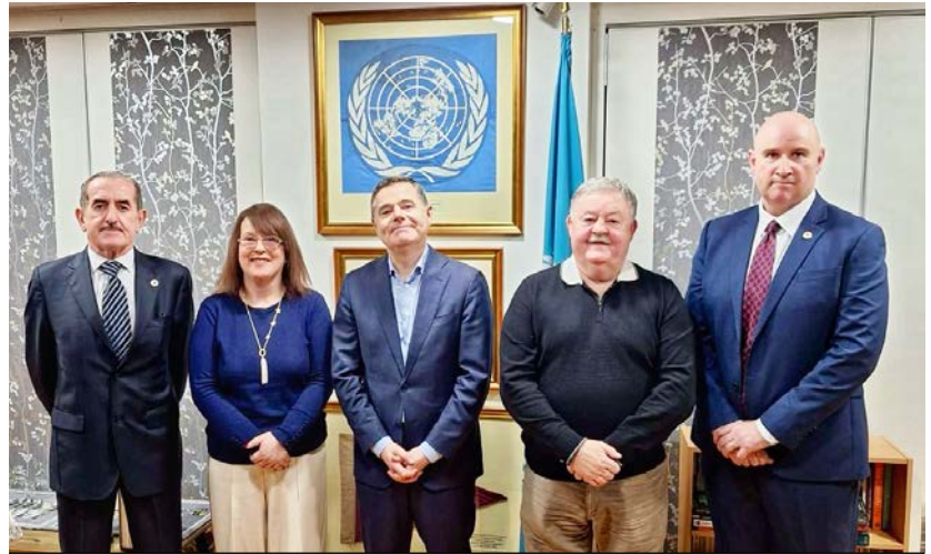
the Minister for Public Expenditure, NDP Delivery and Reform, Paschal Donohoe T.D., visited Brú na bhFiann recently.

Office of Veteran Affairs: ARCO, IUNVA and ONE have jointly promoted the establishment of an Office of Veteran Affairs. ONE, together with the Irish United Nations Veterans Association, made a written and oral submission to the Oireachtas Joint Committee on Foreign Affairs and Defence on 16 November 2021. The Cathaoirleach of the Committee Mr Charles Flanagan T.D. wrote to both An Taoiseach and the Minister for Defence on 17 December 2021 recommending the development of a “National Veterans’ Policy and an Office of Veterans’ Affairs.”